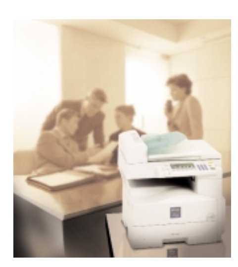
Placed on any desk, the Aficio™1013/1013F offer true desktop convenience.