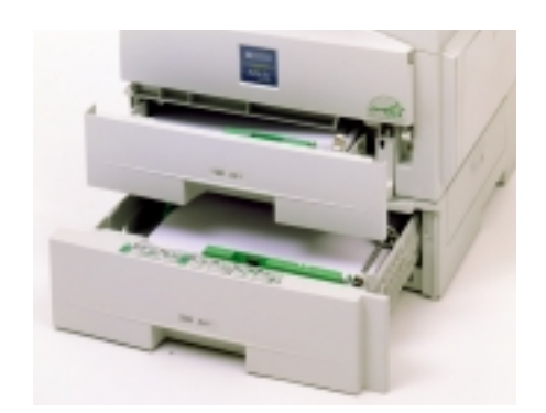
Triple your paper capacity with an additional 500-sheet paper bank.

Fast communication is essential when you have tight deadlines to meet. The powerful fax functionality of the Aficio™1013F (optional for Aficio™1013) caters to this need. With the 33.6 Kbps modem speed and fast 3-second transmission, it can easily handle your workgroup fax requirements. As the Auto Document Feeder scans your documents automatically you don't have to wait by the machine to feed them manually.