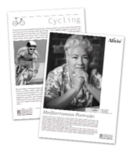
All copies made by the Aficio™1013/1013F look exactly like your original.

The Aficio™1013/1013F will effortlessly keep up with your business dynamics. Equipped with Ricoh's state-of-the-art digital technology, these multi-functional solutions offer productive, reliable, high-quality performance that outlasts any traditional system. And the best part? You obtain all the added advantages at no extra expense!