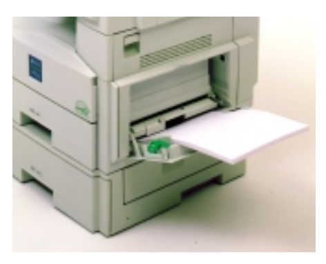
Special kinds of paper can be fed from the 100-sheet Bypass Tray.