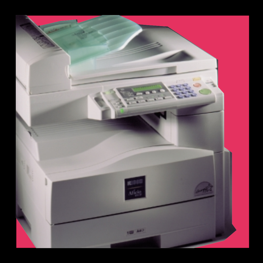
Flexible Digital Solutions for your Desktop