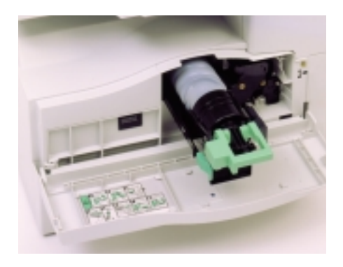
The Aficio™1013/103F only use one consumable for copy, print and fax functions.

As you would expect from Ricoh products, the Aficio™1013/1013F boast an environmentally friendly design. Ozone emission from the Photo Conductor Unit is limited so you won't experience any discomfort. Thanks to the Energy Saver Mode both systems go to Low Power after a certain period of inactivity. This not only saves energy, but also eliminates any noise that may disturb you while you're working.